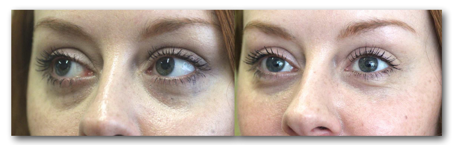
(Left) 24 year old lady complaining of dark circles and minimal bulging due to tear trough deformity and minor lower lid orbital fat prolapse. (Right) Same patient two weeks following tear trough filler treatment with restylane.

therefore may not be able to offer any refund in the event of patient disappointment and any refunds (whether partial or full) of procedure fees in the event of patient disappointment are wholly discretionary.